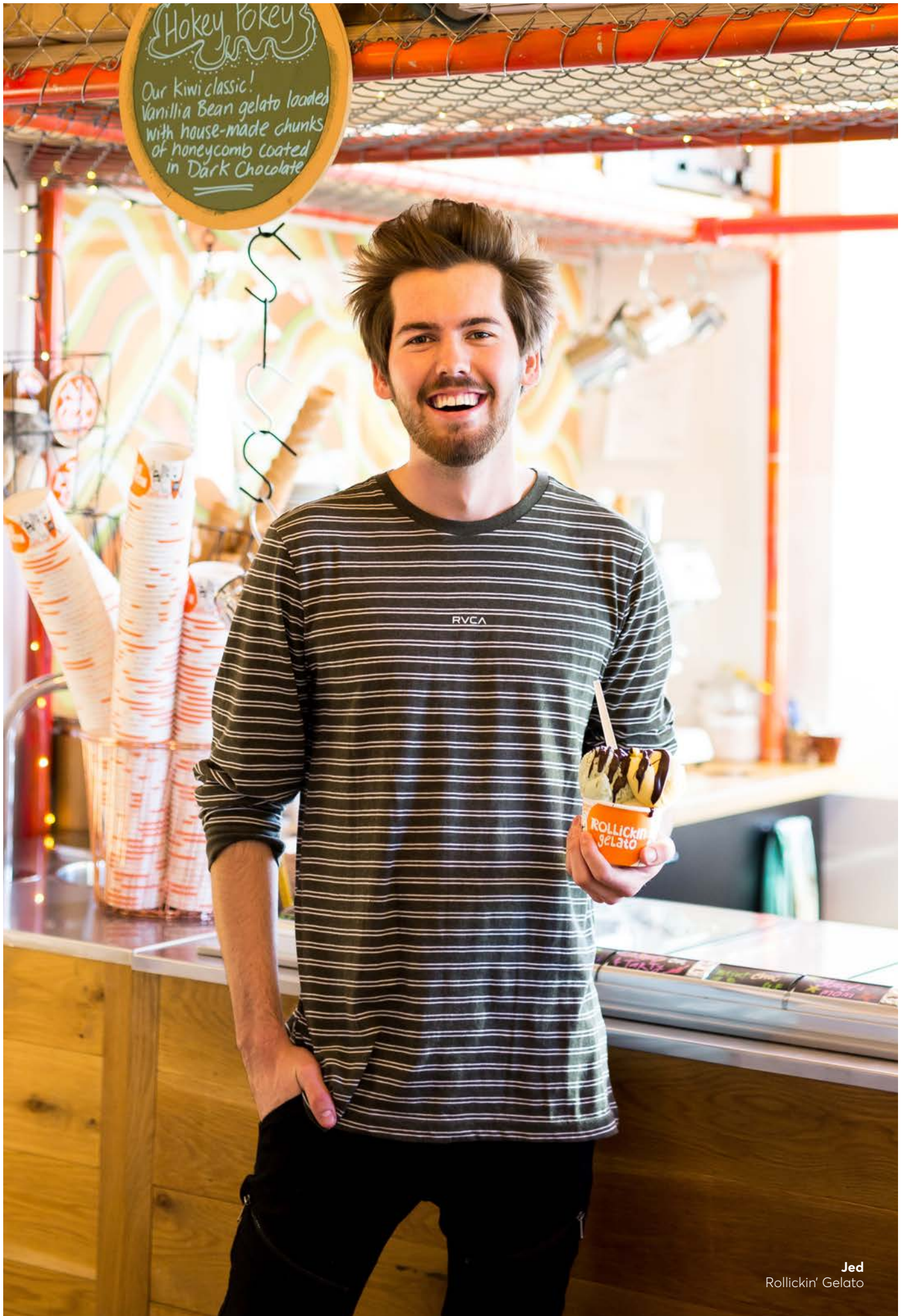
Jed Rollickin' Gelato